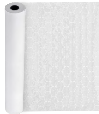
Rolls also available