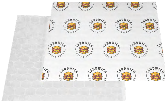
Custom print available